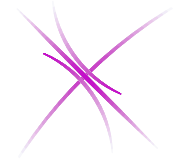
Figure 1: Preparing for ICT procurement