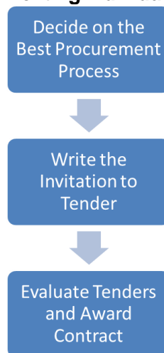
Figure 2: Implementing individual procurements

After the procurement is complete it is good practice to review the process and the outcome of the procurement, drawing lessons where relevant and noting successful practice.